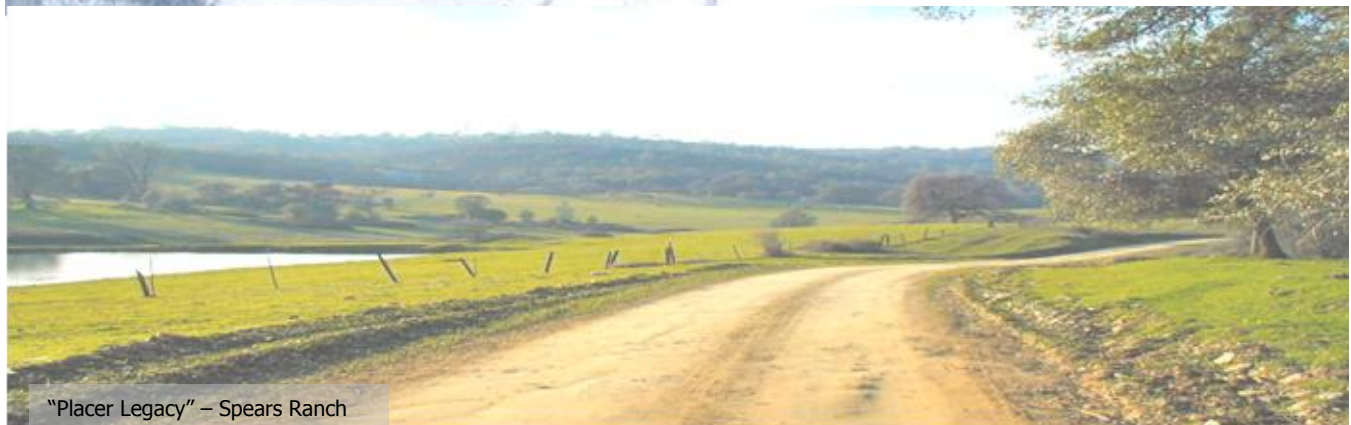
"Placer Legacy" - Spears Ranch