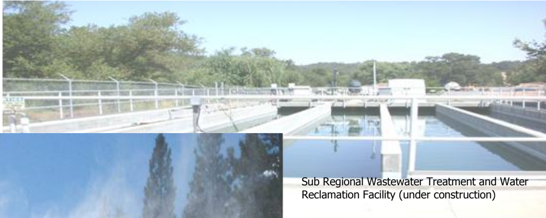
Sub Regional Wastewater Treatment and Water Reclamation Facility (under construction)