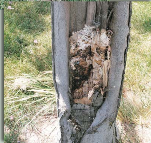
Trunk wound with advanced decay

Other publications in this series include: