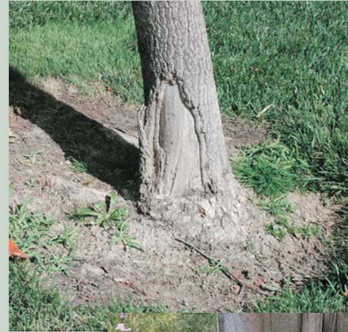
Trees with trunk wounds are susceptible to disease and pests

Construction activities can cause serious damage and even death to trees if proper measures are not used to protect the trees. Injuries to trees are not always obvious, and the decline of the tree may not be evident for months or years after the construction activities are complete. When such conditions do become evident, it is often too late to correct the damage, and tree loss or tree hazards may result.