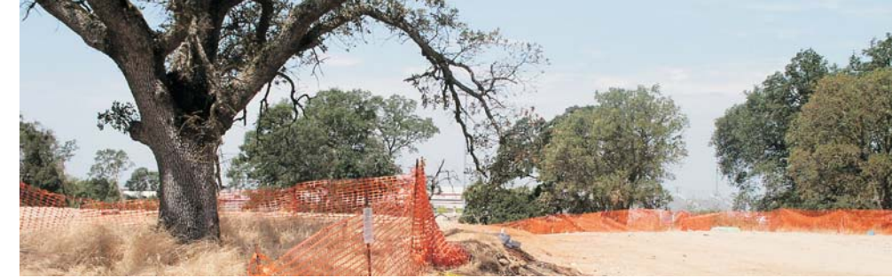
Make sure protective fencing is placed outside the dripline of all trees to be preserved