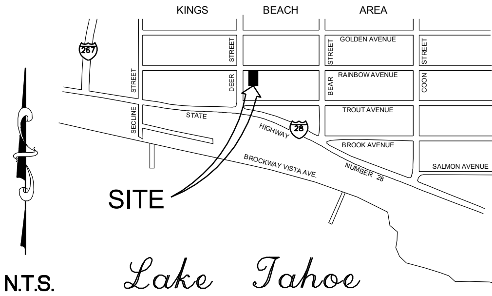
Figure 1 Project Location KBCCIP - Rainbow Parking Lot Dokken Engineering