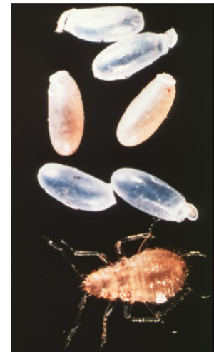
From “flat as a piece of paper” to “animated blood drop”—a common bed bug shown before feeding (top left) and afterwards (bottom left). At right, a newly hatched bed bug shown next to empty and maturing eggs.