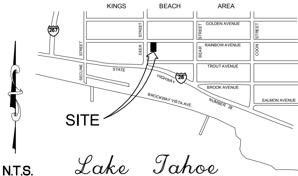
Figure 1 Project Location KBCCIP - Rainbow Parking Lot Dokken Engineering