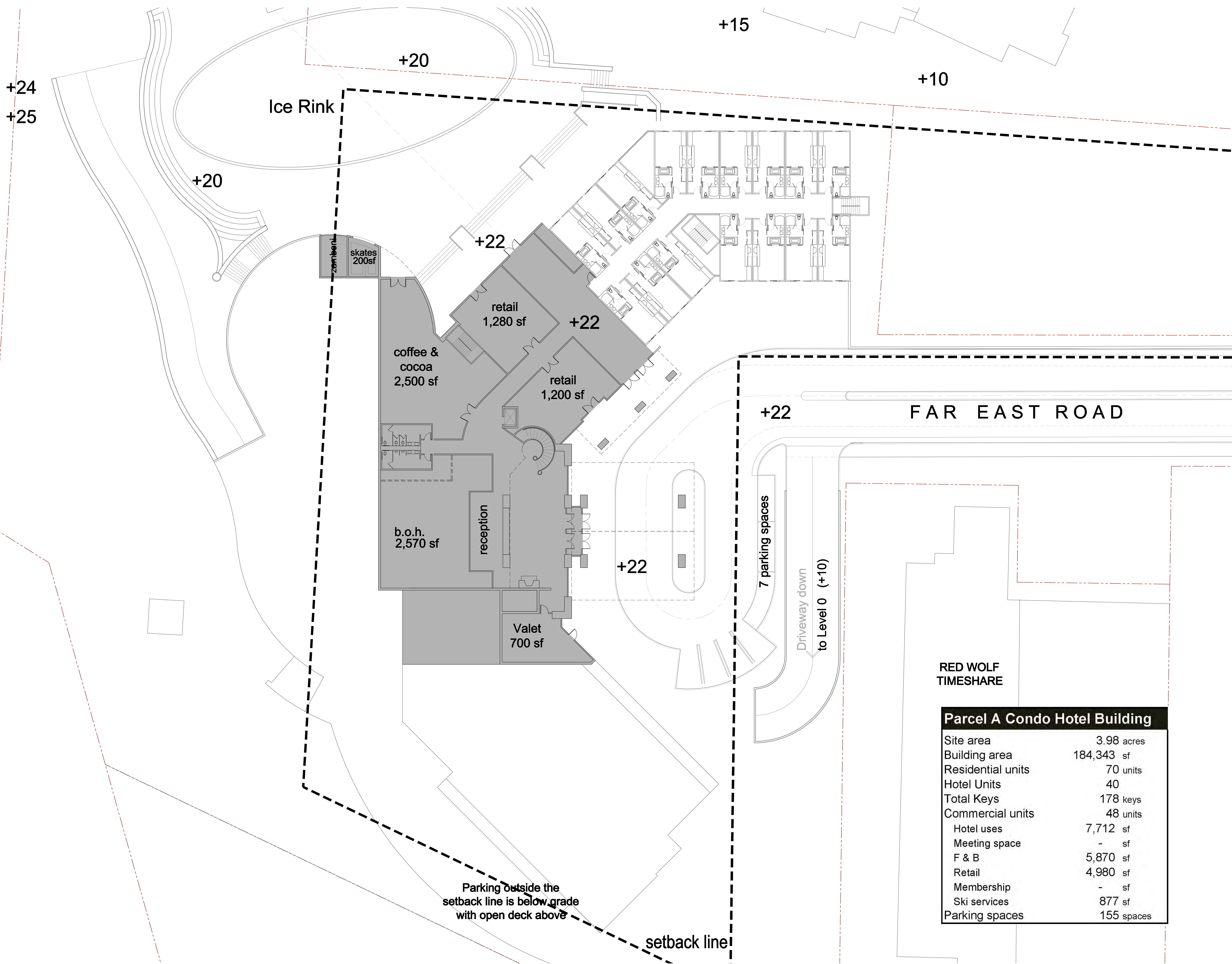
LEVEL 1 FLOOR PLAN SCALE: 1/16"=1'-0"